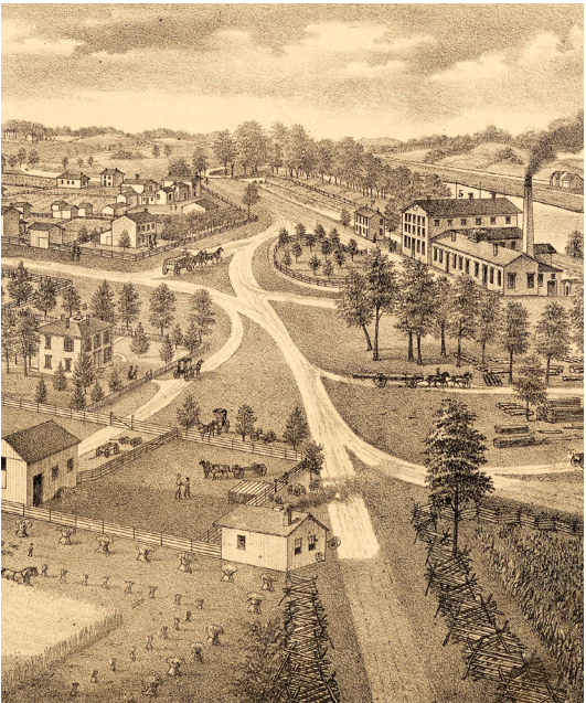
Butler County Scene, 1875 Atlas