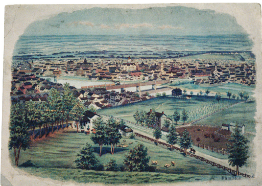
Hamilton, 1890 Lithograph

In the 21st century Butler County and its communities are experiencing significant revitalization. Museums, historic sites, historical societies, history research facilities and related organizations tell its fascinating story. This booklet is a guide to unique architecture, significant artifacts, original documents, changing exhibits and public programs. We encourage you to explore the county's rich history and heritage.