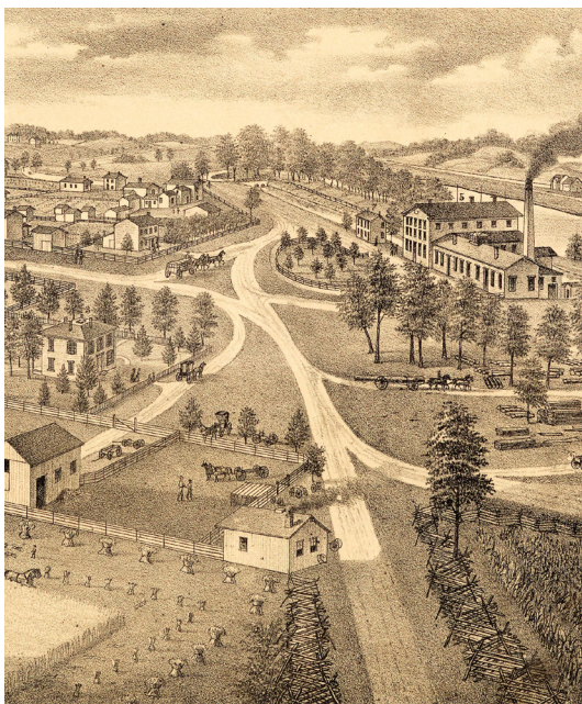
Butler County Scene, 1875 Atlas